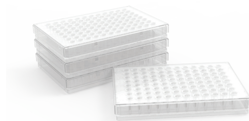
96-/384- Well Plate