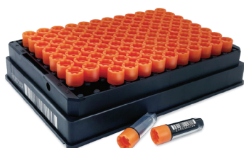
96-Well Format Sample Storage Tube